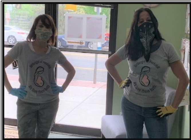
Birthright Volunteers in the office helping during COVID

“Spread love everywhere you go . Let no one ever come to you without leaving happier.” -Mother Teresa.