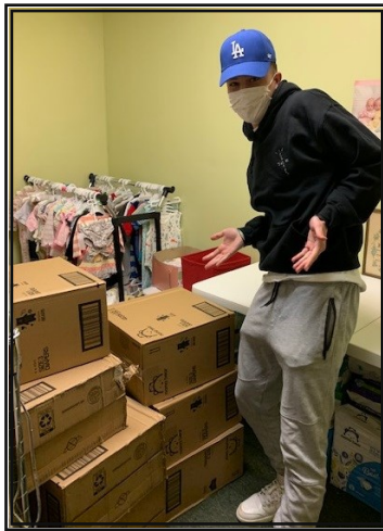
Volunteer helping in the office.